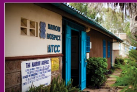
Nairobi Hospice [ Kenya ]