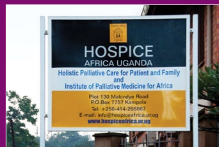
Hospice Africa Uganda [ Uganda ]

APCA thanks the staff and patients of Hospice Africa Uganda, the Machakos Palliative Care Unit and Nairobi Hospice for enabling us to illustrate aspects of palliative care delivery in this report. The commitment and drive shown by these organisations are vital in helping attain APCA's goal of palliative care service delivery for all in need throughout Africa.