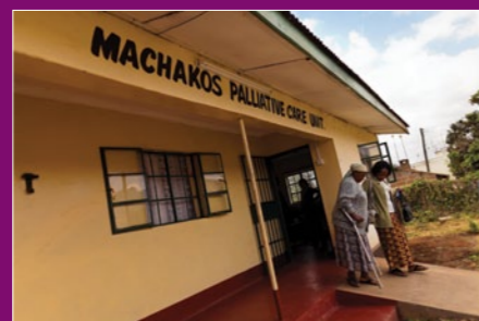
Machakos Palliative Care Unit [ Kenya ]